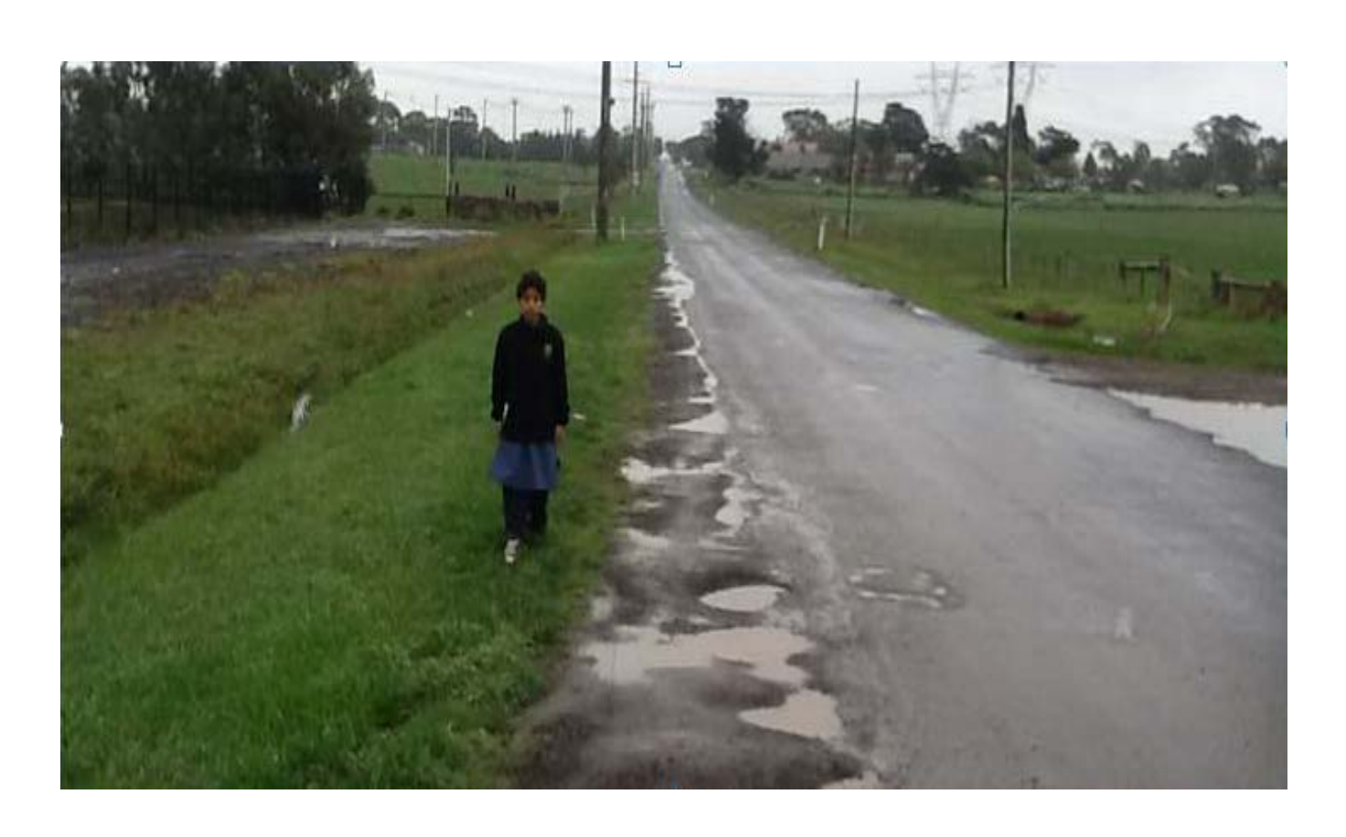
"There have been numerous road accidents near the school, parents are scared to let their kids walk" - Al Siraat College Principal